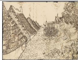
Vincent Van Gogh Street in Saintes-Maries-de-la-Mer