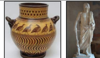
Ancient Greek Statue Sculptures Ancient Greek Pottery