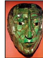
Ancient Mayan Mask