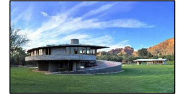
Frank Lloyd Wright