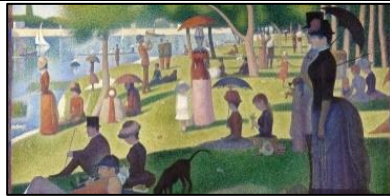
A Sunday on La Grande Jatte Georges Seurat